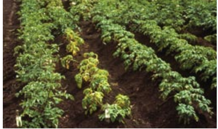
Potato field exhibiting symptoms of R. solanacearum R.3, B. 2

including wearing gloves or washing hands between handling of varieties, and use footbaths between houses. Keep areas free of weed hosts. A quaternary ammonium compound or other labeled greenhouse disinfectant should be used on benches and equipment after an outbreak.