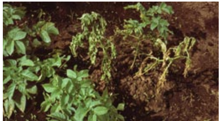
Potato plant infected by R. solanacearum R. 3, B. 2

In potato, clean seed is essential for avoiding R. solanacearum race 3 biovar 2.