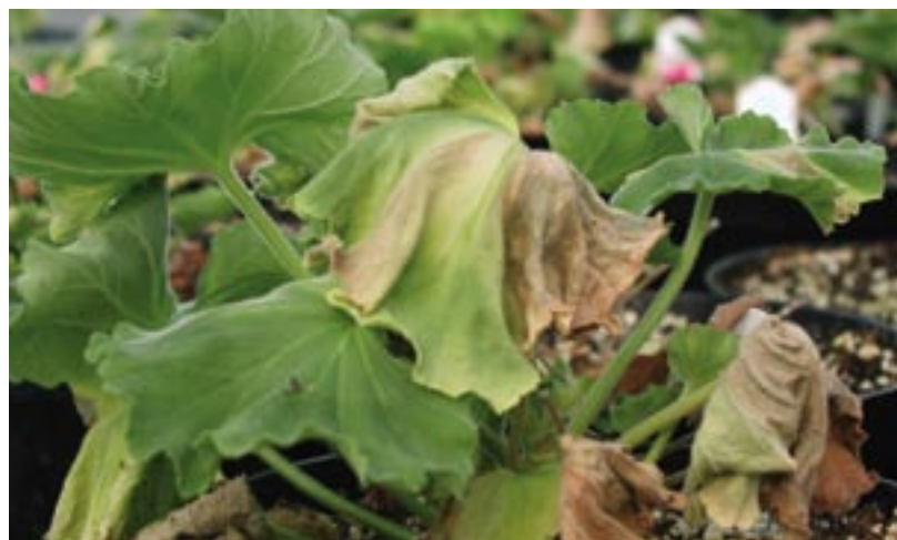
Geranium plant infected by R. solanacearum R. 3, B. 2, exhibiting southern wilt symptoms.

Symptoms of potato brown rot (also known as bacterial wilt) include wilting, stunting, and yellowing of the foliage, and eventually death. Leaves often curl upwards and symptoms may occur at any stage of potato growth. Wilting may be severe in young plants of highly susceptible varieties. Often, one branch in a hill may show wilting. With rapid disease development, all stems in a hill may